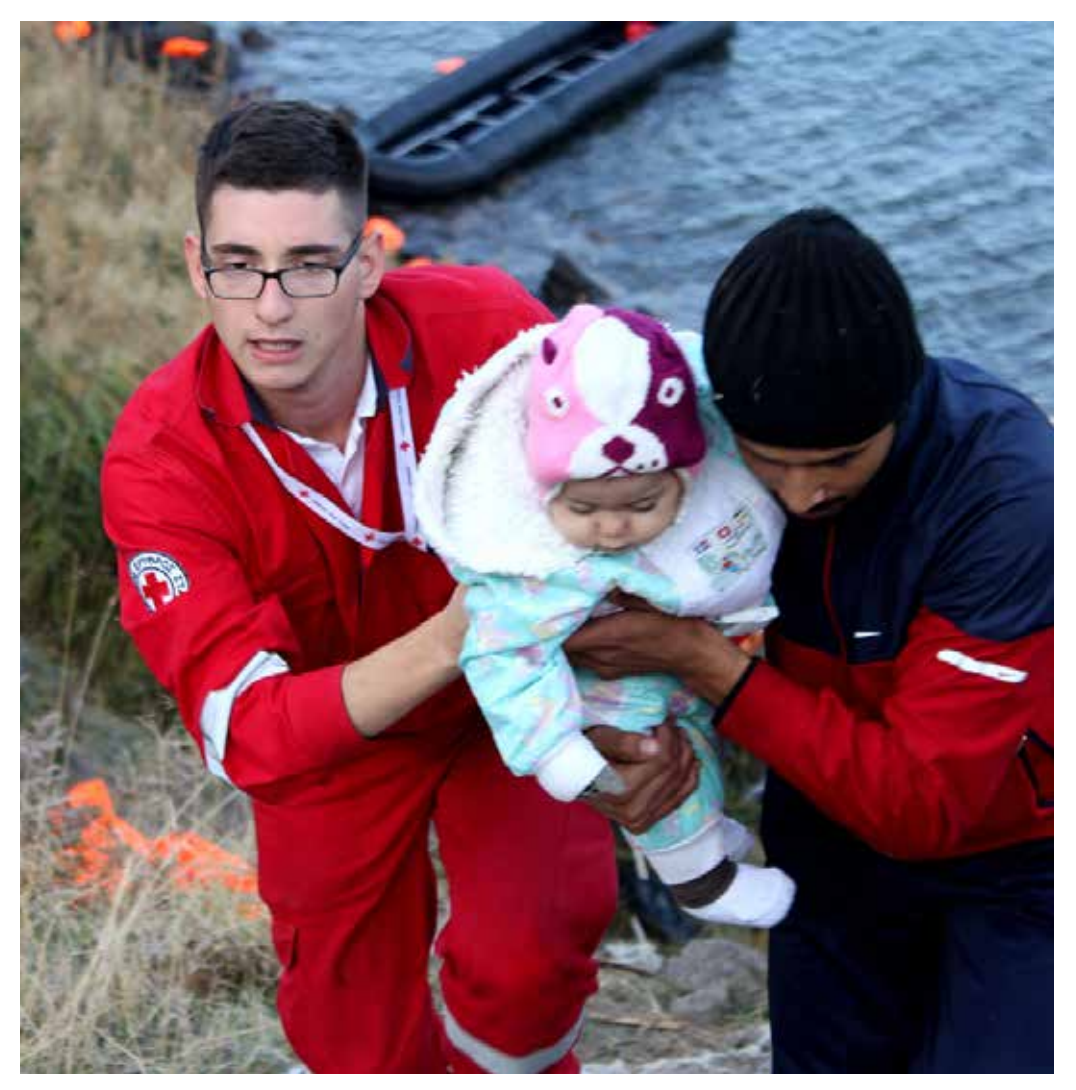
On shores of Lesvos, A Hellenic Red Cross rescue team of volunteers helps migrates get out.