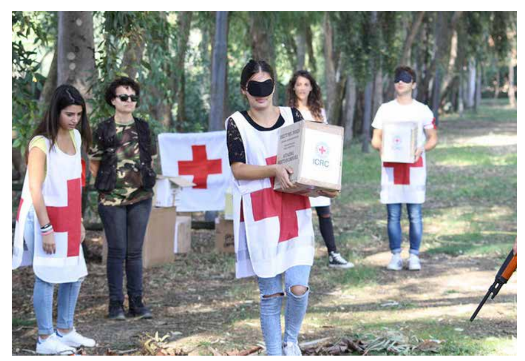
IHL dissemination session organized by the Italian Red Cross