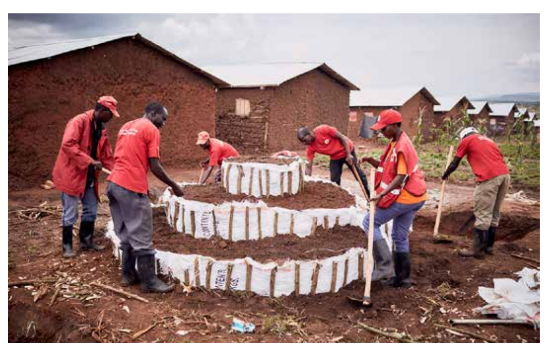
Rwandan Red Cross volunteers active in a food security programme.

17 | Mid-term review of the outcomes of the 32nd International Conference of the Red Cross and Red Crescent