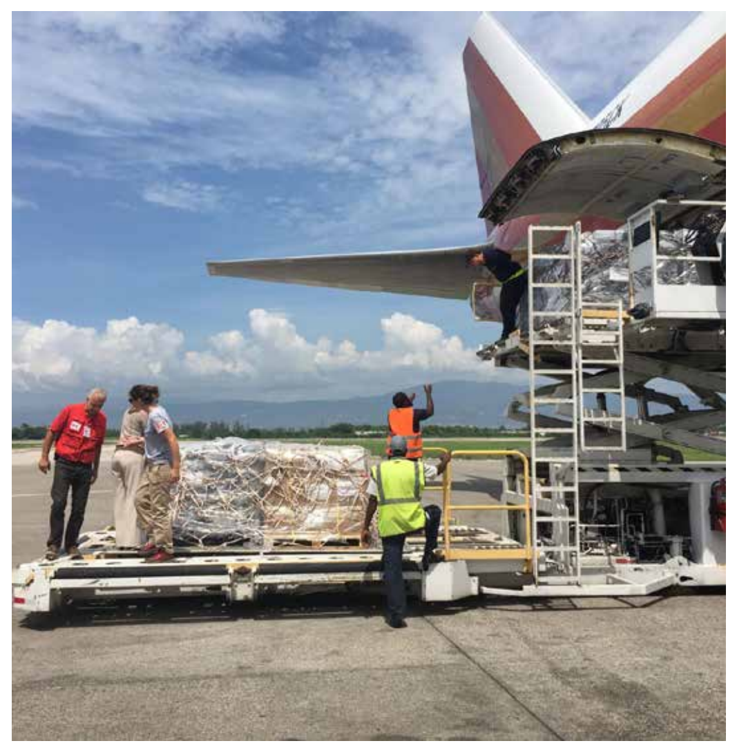
This relief flight landed in Port-au-Prince two days earlier than initially planned after Hurricane Matthew, athanks to new customs rules (10/2016)

national disaster management agency (CONRED) to support the revision of an integrated risk management law in the country. The request was accepted and work commenced in 2016. In Panama, the government formed an IDRL taskforce to develop an IDRL law with the technical support of the IFRC. In St. Vincent and the Grenadines and Grenada, IDRL legislative reviews were underway with the support of the respective National Societies, identifying the key gaps and recommendations to improve their legislation to better facilitate international humanitarian assistance in disasters. In Paraguay, a draft IDRL law was reviewed and finalized for presentation to the National Emergency Department (SEN) in February 2016.