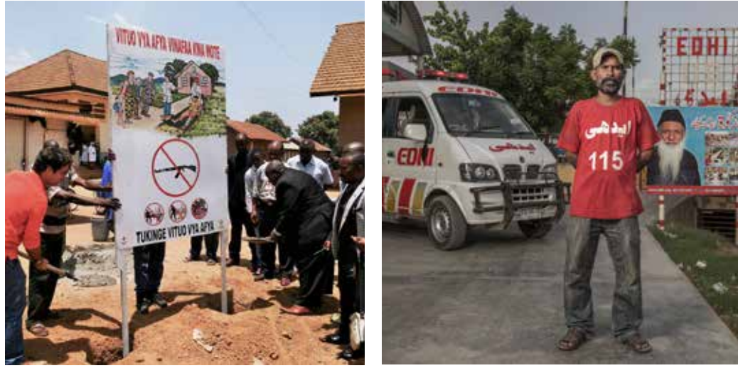
DRC, North Kivu, town of Beni, general hospital. A panel is put in front of the general hospital to promote the respect of the emblems and the protection of the medical mission